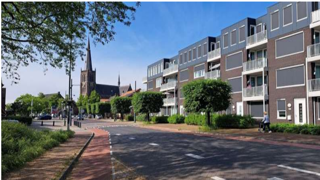
F I SHMMH

The St. Lucia Church is the parish church of Mierlo-Hout in Helmond and is dedicated to Lucia of Syracuse.